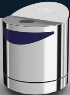
ZERK-C-TM EZ Gear Sensor Retrofit Kit

Heavy-duty brass body with polished chrome finish stands up to extreme wear without losing its luster.