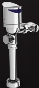
ZER6000AV-TM Water Closet

Available with water closet flow rates from 3.5 gpf down to 1.1 gpf. Available in urinal flow rates from 1.0 gpf to 0.125 gpf.