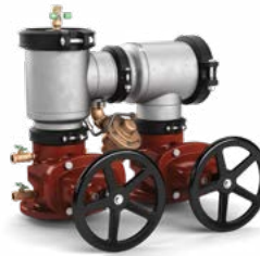
475ST 4"-10" OSY, PI or Butterfly (optional)