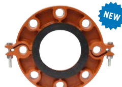
FP8 2"-10" Type: Grooved Split