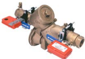
BVMS 3/4\"-2\" Ball Valve Monitor Switch