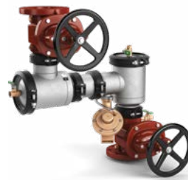
475STRV 4"-10" OSY, PI or Butterfly (optional)