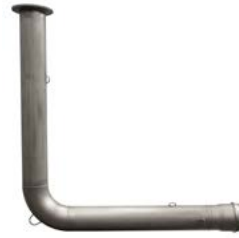
WBR-F 4"-10" Flanged Outlet