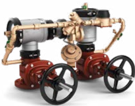
475STDAR 4"-10" OSY (standard), PI or Butterfly (optional)