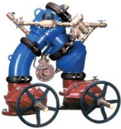
475DA 4"-10" OSY (standard), PI or Butterfly (optional)