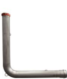
WBR 4"-10" Grooved Outlet