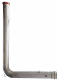
WBR6X8.5 4"-10" Extended 8.5 ft vertical leg grooved outlet