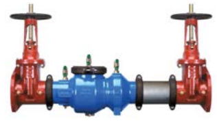
350AR 2-1/2"-10" OSY, PI or Butterfly (optional)