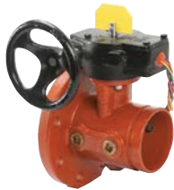
49 2-1/2\"-10\" Butterfly Valve Options: GxG, GxF, FxG