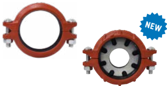
FP23 Types: Reducing, Rigid (R), Flex (F) Sizes: 1"-10" (Rigid), 1-1/4"-10" (Flex), 1-1/2" x 1-1/4" to 8" x 6" (Reducing)