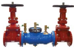
350 2-1/2"-12" OSY, PI or Butterfly (2-1/2"-10") (optional)

Large Diameter Models: 350, 350A, 350AST, 350AR, 350ASTR, 450, 450ST, 450STR