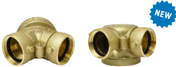
FDC2 4" NPT x 2-1/2" NH Options: Back Inlet, Bottom Inlet