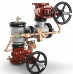
475STDAV 4"-10" OSY (standard), PI or Butterfly (optional)