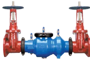
350A 2-1/2"-10" OSY, PI or Butterfly (optional)