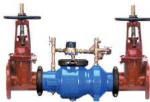
350ADA 2-1/2"-10" OSY (standard), PI or Butterfly (optional)