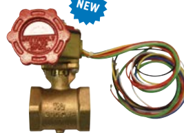
F49BR 1\"-2-1/2\" Powerball Butterfly Valve Threaded Connections