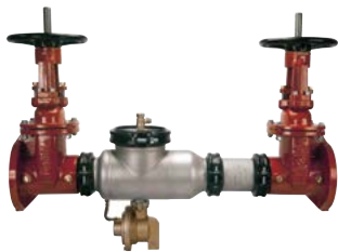
375ASTR 2-1/2"-10" OSY, PI or Butterfly (optional)