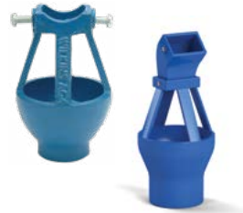
Air Gap Drain 1/4"-10" AG-4 through AG-14