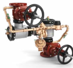
475STDARV 4"-10" OSY (standard), PI or Butterfly (optional)