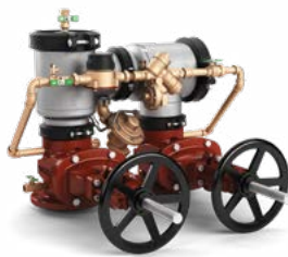
475STDA 4"-10" OSY (standard), PI or Butterfly (optional)