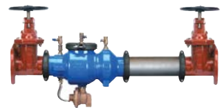
375AR 2-1/2"-10" OSY, PI or Butterfly (optional)