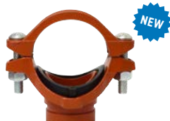
FP63 1-1/4"-8" Types: Grooved (G), Threaded (TF), U-bolt (LTF)