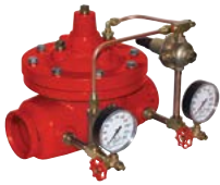
ZW209FP 1-1/2"-10" Pressure Reducing Valve