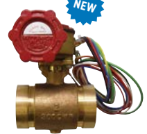
F49BRG 1-1/4\"-2-1/2\" Powerball Butterfly Valve Grooved Connections