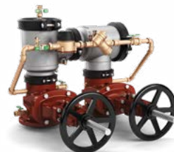
450STDA 4"-10" OSY (standard), PI or Butterfly (optional)