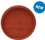
FP3 1-1/4"-8" Caps