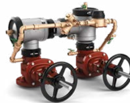
450STDAR 4"-10" OSY (standard), PI or Butterfly (optional)