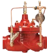
ZW215FP 2"-10" Fire Pump Suction Control Valve