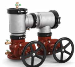
450ST 4"-10" OSY, PI or Butterfly (optional)