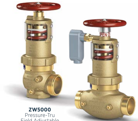
ZW5000 Pressure-Tru Field Adjustable Pressure Reducing Hose Valve

Our Pressure-Tru ZW5000/5004 Series Pressure Reducing Valve fits in tight spaces, takes only 9 ft lb of torque to field adjust, and delivers optimal flow performance – making it ideal for any application, retrofit or new.