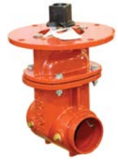
48PI 2-1/2\"-12\" Post Indicator Gate Valve Options: FxF, FxG, GxG