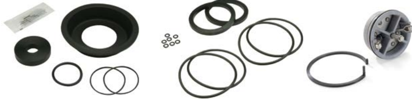
Repair Kits many different kits available for all models and sizes