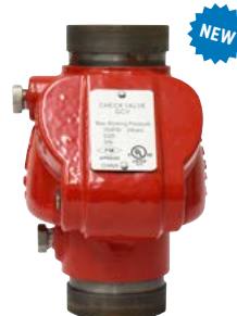
F210 2\"-8\" Check Valve