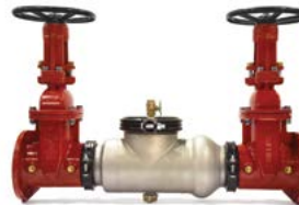
350AST 2-1/2"-10" OSY, PI or Butterfly (optional)