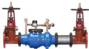
350ADAR 2-1/2"-10" OSY (standard), PI or Butterfly (optional)