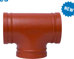
FP53 1-1/4"-10" Types: Tee Short Radius (S), Tee Standard Radius, Reducing Branch Tee (R)