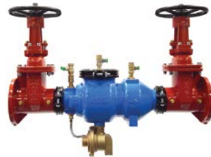
375A 2-1/2"-10" OSY, PI or Butterfly (optional)