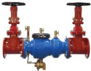
375 2-1/2"-10" OSY, PI or Butterfly (optional)

Large Diameter Models: 375, 375A, 375AST, 375AR, 375ASTR, 475, 475ST, 475V, 475STV, 475STR, 475STRV