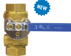
FTD 1\"-2\" Inline Body