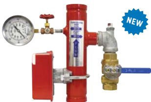
FEZR 2\"-6\" Standard: riser comes standard with test and drain valve, water flow detector switch and a pressure gauge