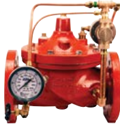
ZW205FP 2"-10" Pressure Relief Valve