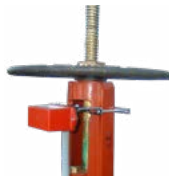
OSY-40 2-1/2\"-12\" Gate Valve Supervisory Switch