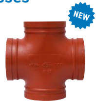
FP56 2"-10" Crosses