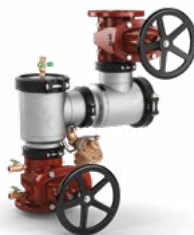
475STV 4"-10" OSY, PI or Butterfly (optional)