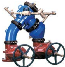
450DA 4"-10" OSY (standard), PI or Butterfly (optional)