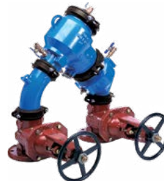
450 2-1/2"-10" OSY, PI or Butterfly (4" - 10") (optional)