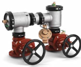
475STR 4"-10" OSY, PI or Butterfly (optional)