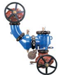
475V 4"-10" OSY, PI or Butterfly (optional)