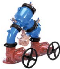
475 2-1/2"-10" OSY, PI or Butterfly (4" - 10") (optional)