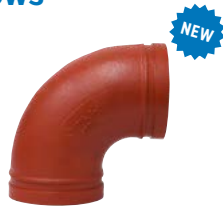
FP52 1-1/4"-10" Types: 90 Degree Short (S), 90 Degree Standard, 45 Degree (-45), 22.5 Degree (-22), 11.25 Degree (-11), End of Run Adapter (GTF)