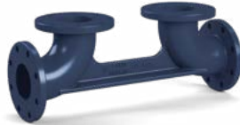
Valve Setters 400ST Series 4"-10" FLSST, MJFSST, MJSST