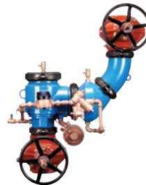
475DAV 4"-10" OSY (standard), PI or Butterfly (optional)