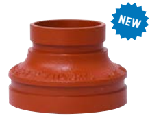
FP51 2"-10" Type: Concentric

Learn more about our fire protection products at zurn.com/fire