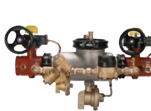
375ASTDA 2-1/2"-10" OSY (standard), PI or Butterfly (optional)