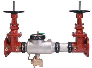
375ASTDAR 2-1/2"-10" OSY (standard), PI or Butterfly (optional)