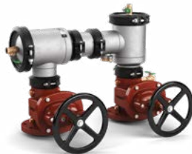
450STR 4"-10" OSY, PI or Butterfly (optional)