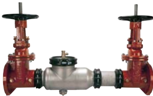
350ASTR 2-1/2"-10" OSY, PI or Butterfly (optional)