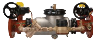
350ASTDA 2-1/2"-10" OSY (standard), PI or Butterfly (optional)