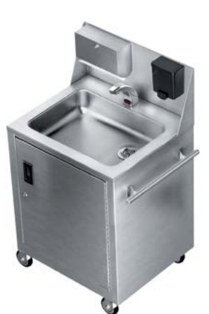
(Fully Accessorized Unit)