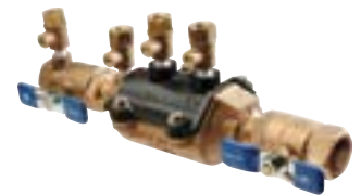
3/4" 350 Double Check Valve Assembly

“The Zurn Wilkins 375 is the easiest and fastest RPZ valve to winterize that we have used in our 41 year history. The valve also requires the least amount of maintenance of any we have installed.”