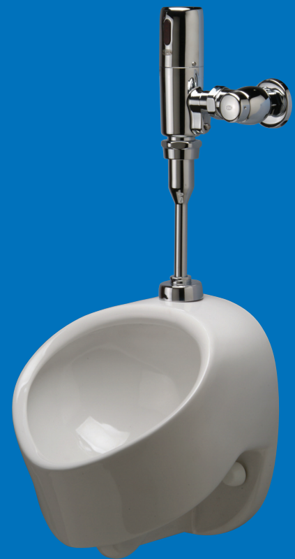
Zurn Nano Pint Urinal

The University of Washington has recently undergone a retrofit plumbing remodeling project to become more "Green" and to conserve more water and energy.