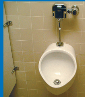
The Zurn Nano Pint urinal uses just 16 ounces of water, is designed for retrofit applications, and saves up to 96% in water usage compared to 3.5 GPF fixtures.