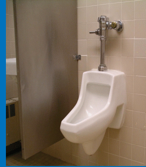
University of Washington: Non-Zurn 3.5 GPF urinal system.