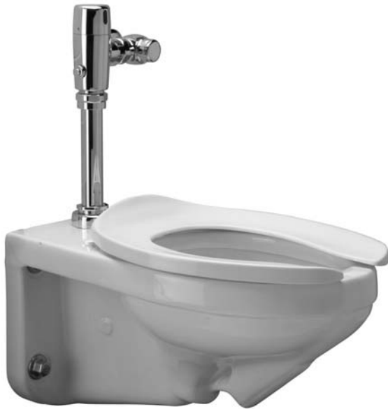
Z5615 Series Elongated