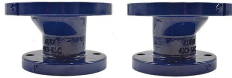
RFK4X3-400ST (two adapters included)