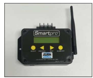
G4 CONTROL PANEL