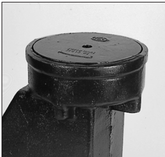
Top View With Cover