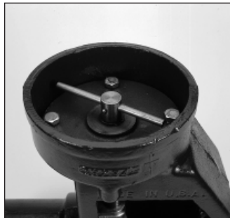
Top View Less Cover