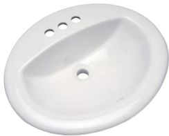
Z5110 Series 20" x 17" countertop lavatory