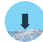
Water Conserving Flush 1.0 gallon [4 liters]