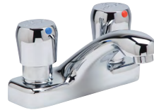
Z86500-XL-3M Ultra low-flow outlet options No battery or electronics required Vandal-resistant metering faucet