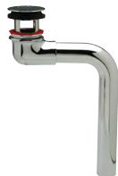
Z8746-PC ADA compliant grid drain