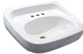
Z5340 Series 20" x 18" wall hung lavatory