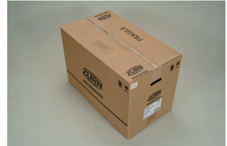
Final pack-out for water closet and brass trim accessories