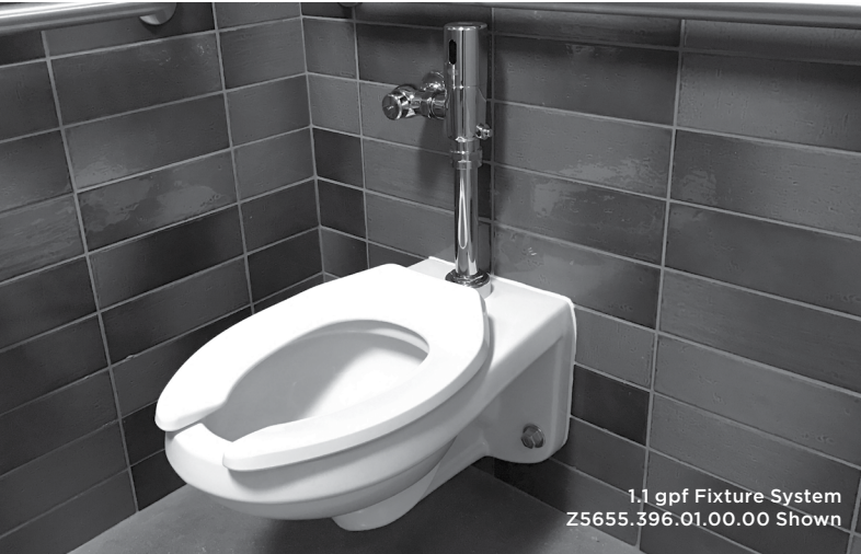
1.1 gpf Fixture System Z5655.396.01.00.00 Shown