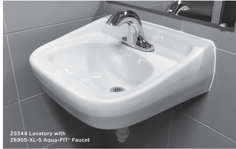
Z5344 Lavatory with Z6955-XL-S Aqua-FIT® Faucet