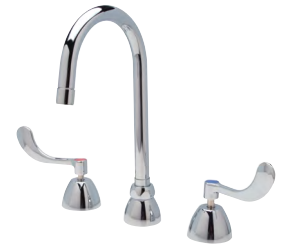
Z831B4-XL-3F Ultra low-flow outlet options No battery or electronics required ADA compliant manual faucet