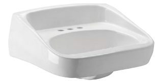
Z5360 Series 20" x 18" high-back wall hung lavatory