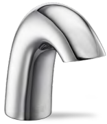
Z6950-XL-S Aqua-FIT® Serio Series™ Sensor Faucet Concealed sensor lens Sustainable Hydro-X Power Custom time-outs, sensor faucet