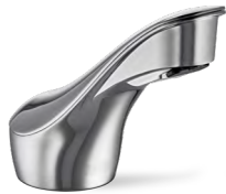
Z6951-XL Aqua-FIT Fulmer Series™ Sensor Faucet Concealed sensor lens Sustainable Hydro-X Power Custom time-outs, sensor faucet Available in 4 finishes