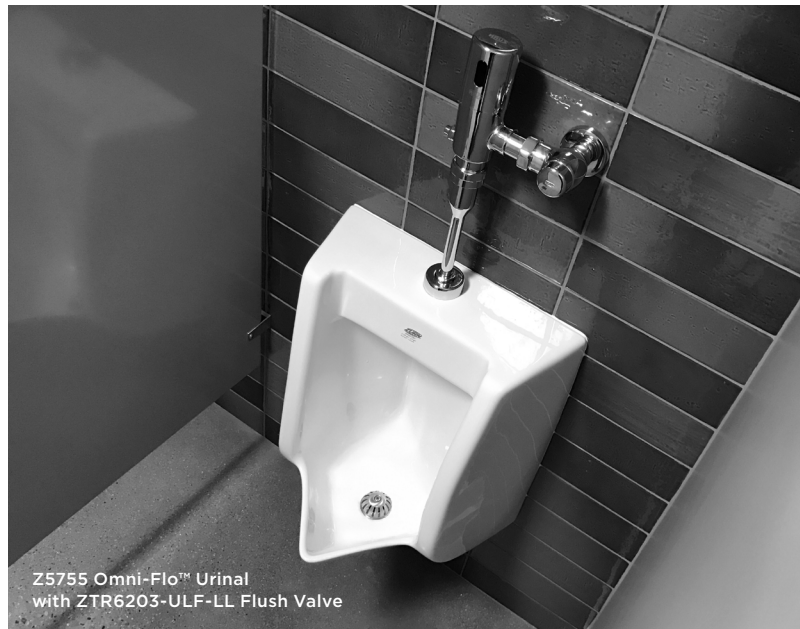
Z5755 Omni-Flo™ Urinal with ZTR6203-ULF-LL Flush Valve