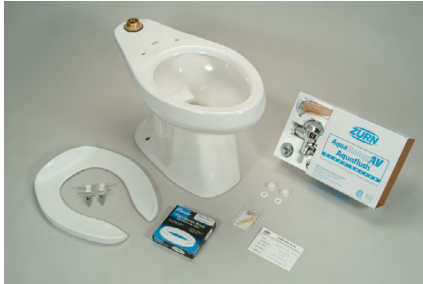
Water closet and accessories

Zurn One Systems combine Zurn flush valves and faucets with Zurn fixtures. These systems are packaged together and shipped in one box to the job site and can be tagged with any information required, such as a specific floor, building, or wing. Receive ready-to-install plumbing solutions for easy organization, handling, and sorting.