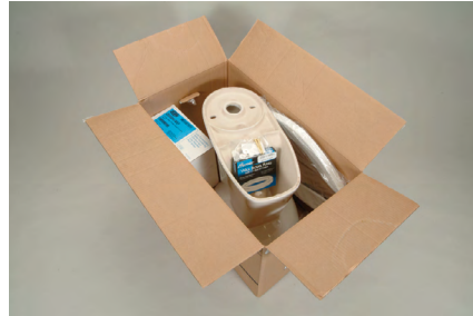
Trim accessories packaged within inner box to protect water closet fixture