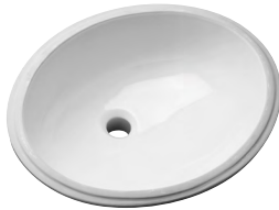
Z5220 Series 19" x 16" undermount lavatory