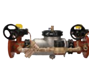
350ASTDA 2-1/2"-10" OSY (standard), PI or Butterfly (optional)