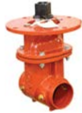
48PI 2-1/2"-12" Post Indicator Gate Valve options: FxG, FxG, GxG