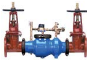
350ADA 2-1/2"-10" OSY (standard), PI or Butterfly (optional)