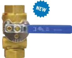
FTD 3/4"-2" inline body