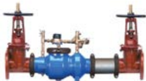
350ADAR 2-1/2"-10" OSY (standard), PI or Butterfly (optional)