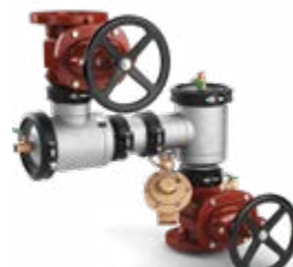
475STRV 4"-10" NRS (standard), OSY, PI or Butterfly (optional)