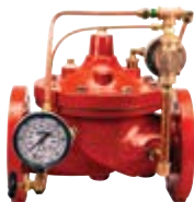
ZW205FP 2"-10" Pressure Relief Valve