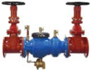
375 2-1/2"-10" NRS (standard), OSY, PI or Butterfly (optional)

Large Diameter Models: 375, 375A, 375AST, 375AR, 375ASTR, 475, 475ST, 475V, 475STV, 475STR, 475STRV