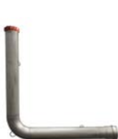
WBR 4"-10" grooved outlet