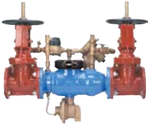
375DA 2-1/2"-10" OSY (standard), PI or Butterfly (2-1/2" - 10") (optional)

Large Diameter Models: 375DA, 375ADA, 375ASTDA, 375ASTDAR, 475DA, 475STDA, 475DAV, 475STDAV, 475STDAR, 475STDARV