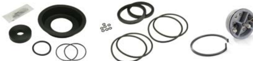
Repair Kits many different kits available for all models and sizes