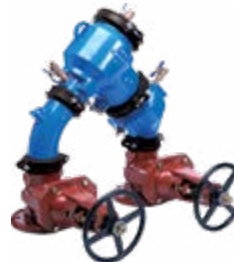
450 2-1/2"-10" NRS (standard), OSY, PI or Butterfly (4" - 10") (optional)