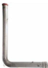
WBR6X8.5 4"-10" extended 8.5 ft vertical leg grooved outlet