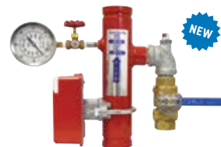
FEZR 2"-6" Standard: riser comes standard with test and drain valve, water flow detector switch and a pressure gauge