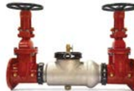
350AST 2-1/2"-10" NRS (standard), OSY, PI or Butterfly (optional)