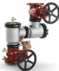
475STV 4"-10" NRS (standard), OSY, PI or Butterfly (optional)