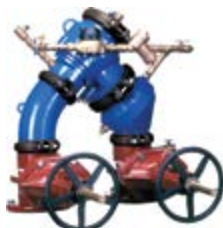
450DA 4"-10" OSY (standard), PI or Butterfly (optional)