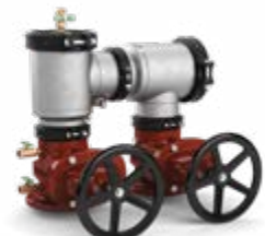
450ST 4"-10" NRS (standard), OSY, PI or Butterfly (optional)