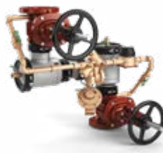
475STDARV 4"-10" OSY (standard), PI or Butterfly (optional)