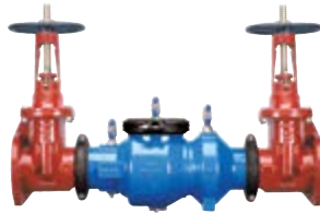
350A 2-1/2"-10" NRS (standard), OSY, PI or Butterfly (optional)