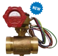
F49BRG 1-1/4"-2-1/2" Powerball Butterfly Valve Grooved Connections