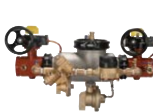
375ASTDA 2-1/2"-10" OSY (standard), PI or Butterfly (optional)