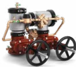
475STDA 4"-10" OSY (standard), PI or Butterfly (optional)