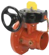
49 2-1/2"-10" Butterfly Valve options: GxG, GxG, FxG