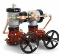
450STDA 4"-10" OSY (standard), PI or Butterfly (optional)