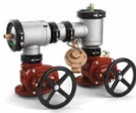
475STR 4"-10" NRS (standard), OSY, PI or Butterfly (optional)