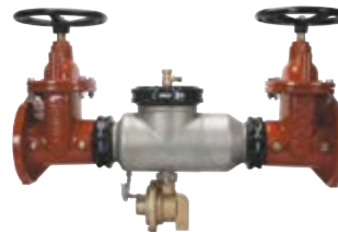
375AST 2-1/2"-10" NRS (standard), OSY, PI or Butterfly (optional)