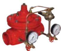
ZW209FP 1-1/2"-10" Pressure Reducing Valve