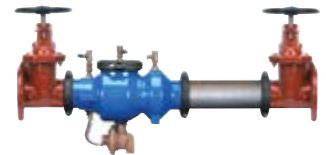
375AR 2-1/2"-10" NRS (standard), OSY, PI or Butterfly (optional)