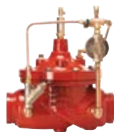
ZW215FP 2"-10" Fire Pump Suction Control Valve