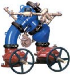
475DA 4"-10" OSY (standard), PI or Butterfly (optional)