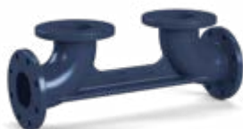
Valve Setters 400ST Series 4"-10" FLSST, MJFSST, MJSST