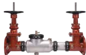
350ASTDAR 2-1/2"-10" OSY (standard), PI or Butterfly (optional)