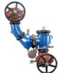
475V 4"-10" NRS (standard), OSY, PI or Butterfly (optional)