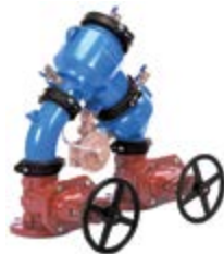
475 2-1/2"-10" NRS (standard), OSY, PI or Butterfly (4" - 10") (optional)