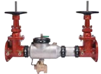
375ASTDAR 2-1/2"-10" OSY (standard), PI or Butterfly (optional)