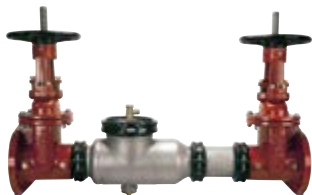
375ASTR 2-1/2"-10" NRS (standard), OSY, PI or Butterfly (optional)