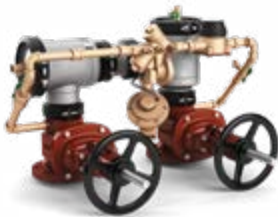
475STDAR 4"-10" OSY (standard), PI or Butterfly (optional)