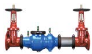
350AR 2-1/2"-10" NRS (standard), OSY, PI or Butterfly (optional)