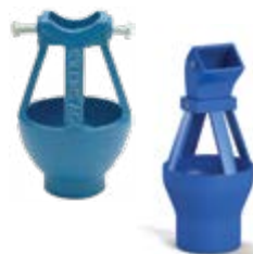
Air Gap Drain 1/4"-10" AG-4 through AG-14