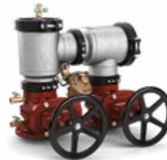
475ST 4"-10" NRS (standard), OSY, PI or Butterfly (optional)