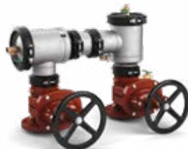
450STR 4"-10" NRS (standard), OSY, PI or Butterfly (optional)