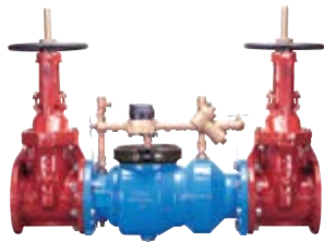
350DA 2-1/2"-12" OSY (standard), PI or Butterfly (2-1/2" - 10") (optional)