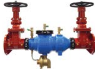
375A 2-1/2"-10" NRS (standard), OSY, PI or Butterfly (optional)