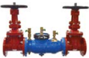
350 2-1/2"-12" NRS (standard), OSY, PI or Butterfly (2-1/2"-10") (optional)

Large Diameter Models: 350, 350A, 350AST, 350AR, 350ASTR, 450, 450ST, 450STR