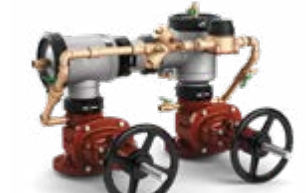
450STDAR 4"-10" OSY (standard), PI or Butterfly (optional)