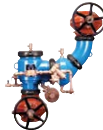
475DAV 4"-10" OSY (standard), PI or Butterfly (optional)