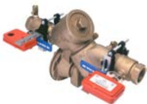
BVMS 3/4" - 2" Ball Valve Monitor Switch