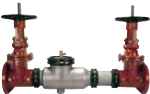
350ASTR 2-1/2"-10" NRS (standard), OSY, PI or Butterfly (optional)