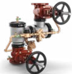
475STDAV 4"-10" OSY (standard), PI or Butterfly (optional)