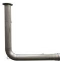
WBR-F 4"-10" flanged outlet